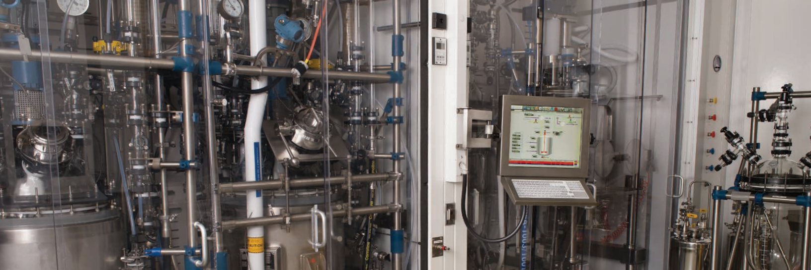
Table 3. State-of-the-art facilities include: